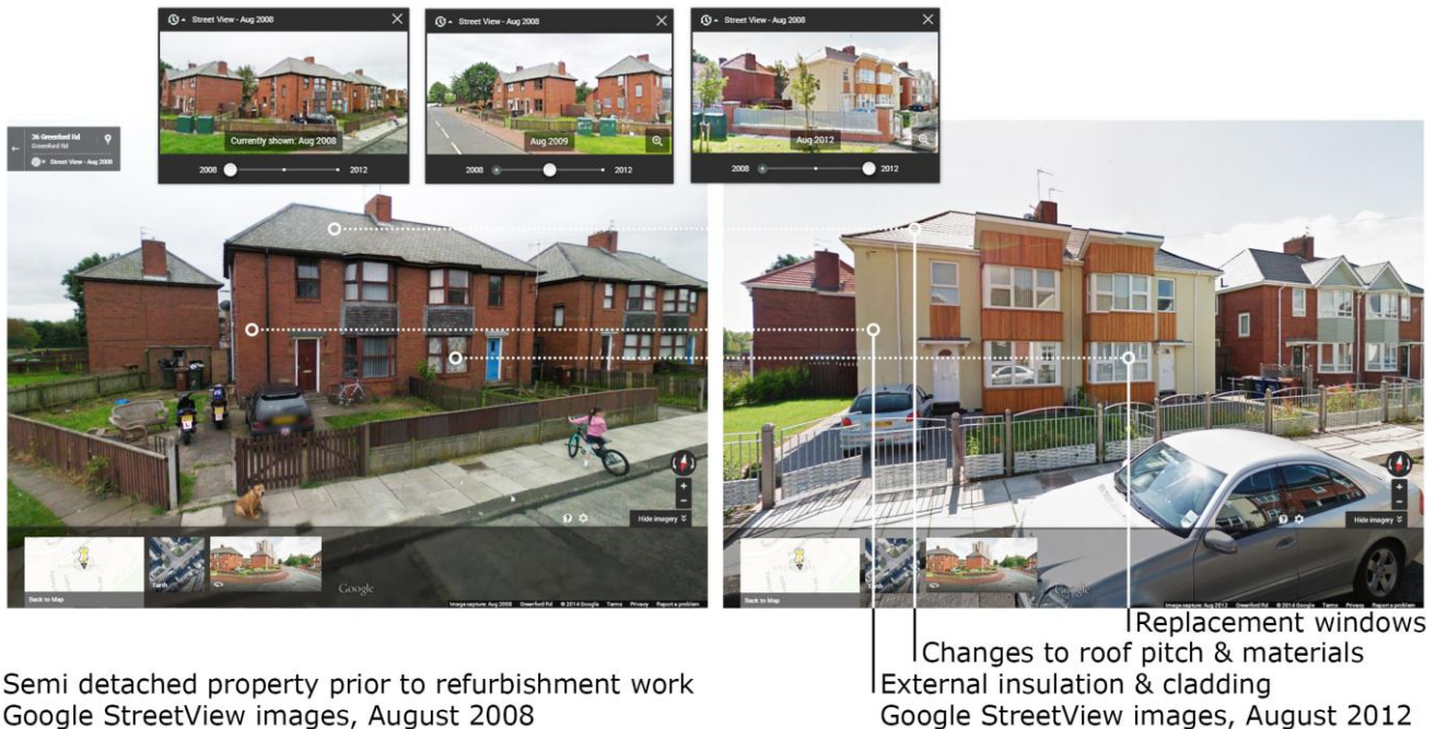
Semi detached property prior to refurbishment work Google StreetView images, August 2008