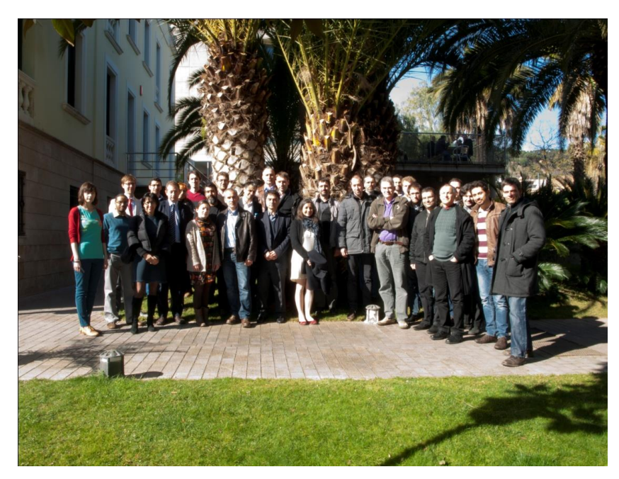
Figure 3. Participants in the VoCamp, School of Engineering and Architecture La Salle, Barcelona

The 4<sup>th</sup>Vocabulary Camp (VoCamp) on "Integrating multiple domains and scales", took place at La Salle Engineering and Architectural School in Barcelona, from the 13<sup>th</sup>to 14<sup>th</sup>February 2014 and was organised by the SEMANCO project.