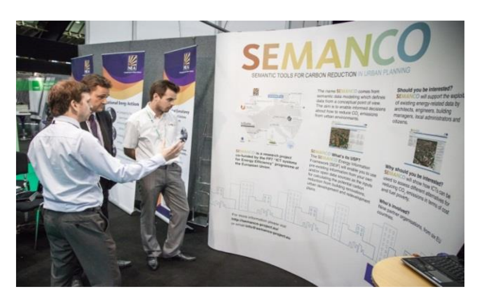
Figure 7. SEMANCO Banner stand at Greenbuild Expo, 2013