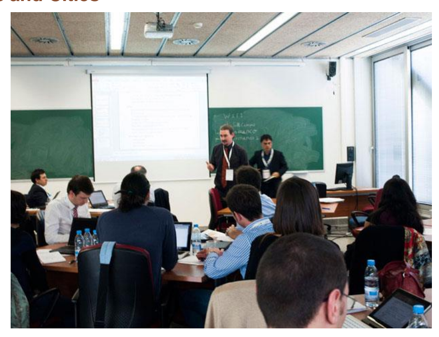
Figure 1. Picture of the event, School of Engineering and Architecture La Salle, Barcelona

The workshop "Analysing and Visualising Energy Related Data in our Buildings, Towns and Cities" was held in Barcelona on the 11<sup>th</sup> and 12<sup>th</sup> of April 2013. The purpose of the workshop was to bring together the community of researchers working on the application of ICT to energy efficiency to discuss three various issues related to the subject of analysing and visualising energy related data.